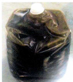
14kg in PE bag