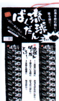
Sheet type for 20 sachets 3 sheets/carton W250xD430xH90/740g