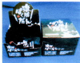
Box type for 10 sachets 15 boxes/ carton W250xD430xH90/960g